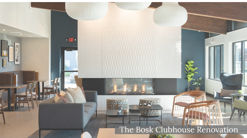
The Bosk Clubhouse Renovation