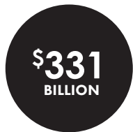
Anti-aging market by the year 2021