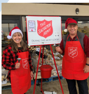
Retirees volunteered as Salvation Army bell ringers in Tulsa .