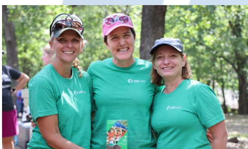
Employees volunteered at the United Way Day of Caring in Tulsa, Oklahoma .