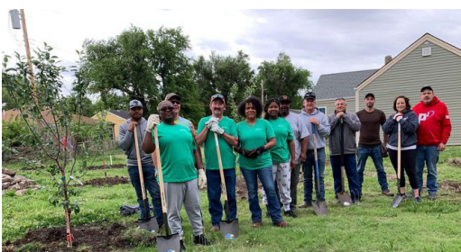
Volunteers planted a mini orchard in a vacant lot in northeast Wichita, Kansas .

Even with busy lives, ONE Gas employees generously gave their time to make a positive impact in their communities. Some of the highlights of our volunteer projects include building houses, fighting food insecurity, supporting youth development and working toward community improvement.