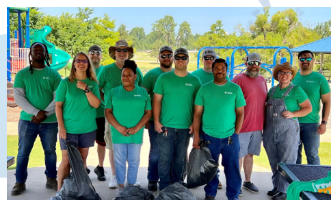
Employees in Oklahoma City volunteered at the local Litter Blitz.