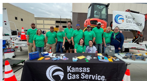
More than 25 employees volunteered at a "Touch-a-Truck" event in Topeka, Kansas .