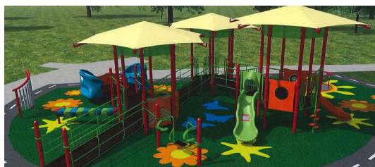
A rendering of The Center's new accessible playground.

Philanthropic Focus Area: Community Collaboration