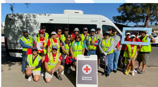
Volunteers helped "Sound the Alarm" for the Red Cross in El Paso, Texas .