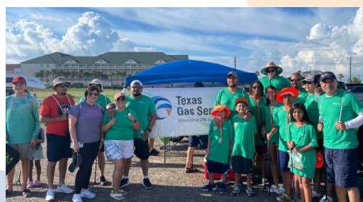
Employees and family members helped clean up a beach in Harlingen, Texas .