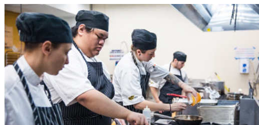
WSU Tech students practice their culinary skills on the commercial natural gas stove.

In Kansas, we partnered with Wichita State University Technology (WSU Tech) for their National Institute for Culinary and Hospitality Education (NICHE) in downtown Wichita. It will feature state-of-the-art commercial kitchens, classrooms, a demonstration kitchen, an open-to-the-public food hall, student-ran café and rooftop event center. The ONE Gas Foundation provided a grant to purchase specialized equipment.