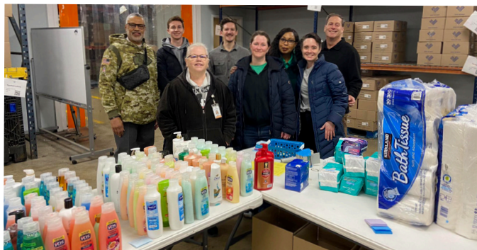
Kansas Gas Service co-workers volunteered with Giving the Basics in Kansas City . Giving the Basics is a Kansas City-based nonprofit that provides hygiene products to residents in need.