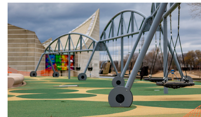
Center Pivot Irrigation Swings at EP2's Adventure Playscape, sponsored by the ONE Gas Foundation.

In Wichita, Kansas , we partnered with Exploration Place, the city's premier science and education center. We support their EP2 Initiative, expanding its outdoor footprint with a six-acre, world-class play environment shaped by feedback from more than 11,000 visitors. Designed to spark imagination through hands-on zones that blend STEM learning, nature and local pride, the new space will offer families an engaging way to explore science outdoors.