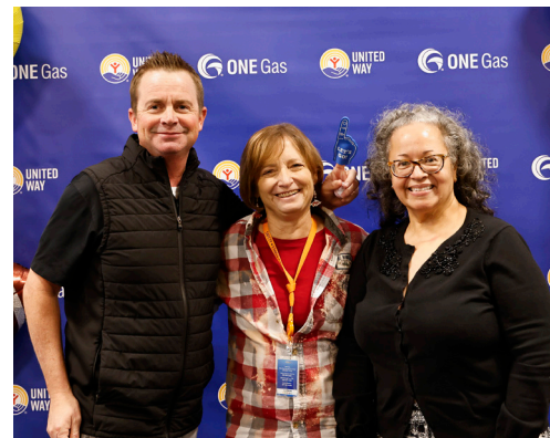
ONE Gas employees pose for a photo at Rally Day

Employees and retirees who volunteer at least 25 hours throughout the year can request a $250 Volunteer Grant for one nonprofit they volunteered with.