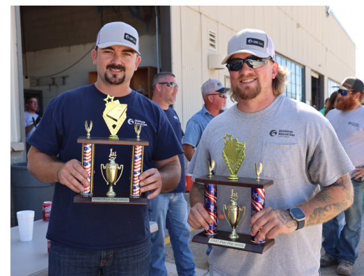
Cornhole Tournament Champions at Oklahoma Natural Gas' Fun Day, 15th Street Service Center in Tulsa

In 2025, our company continued its long-standing support of the United Way, partnering with 44 local United Way organizations across our footprint. We understand what an important role United Way agencies play in the communities we serve and where our employees live and work.