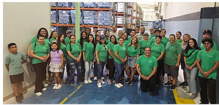
In El Paso, Texas , nearly 40 Texas Gas Service volunteers rolled up their sleeves to support the El Pasoans Fighting Hunger Food Bank , assembling food boxes for residents in need.