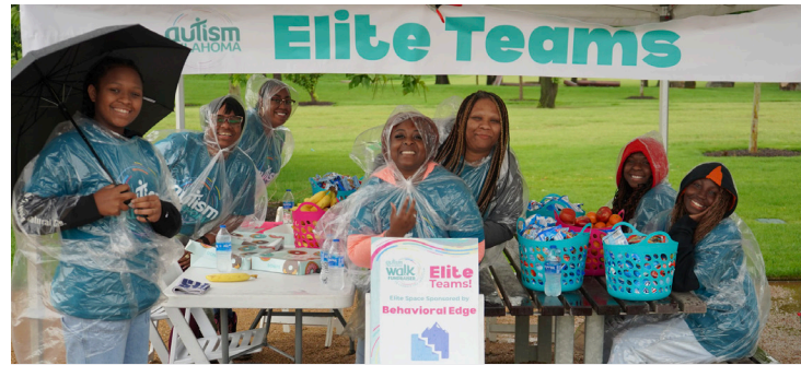
Oklahoma Natural Gas employees demonstrated our Core Value of Service by volunteering at the Oklahoma City Piecewalk , raising awareness for AutismOklahoma.

Last year, employees, retirees and their family and friends across our footprint volunteered 10,575 hours at local nonprofit organizations.