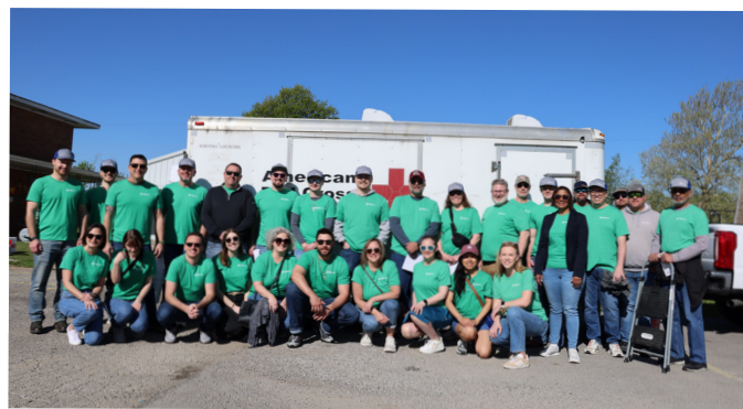
In Tulsa, Oklahoma , more than 30 volunteers partnered with the American Red Cross for the Sound the Alarm campaign, canvassing homes and installing 68 smoke alarms in nearly 50 homes.