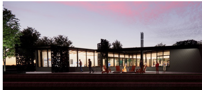
Architectural rendering of the Cross Timbers Welcome Center at dusk

With an expected 1 million annual visitors, the fire pit will enhance year-round comfort, strengthen community connection and support the park's mission to make art, nature and play accessible to all. The project aligns with our commitment to energy literacy and community enrichment and will be completed ahead of the park's Fall 2026 grand opening, coinciding with the Route 66 Centennial Celebration.