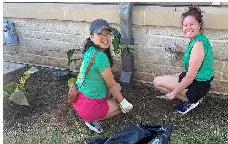
ONE Gas employees volunteered at Domestic Violence Intervention Services (DVIS) during United Way Day of Caring in Tulsa, helping beautify the facility grounds for those it serves.

ONE Gas and our employees are dedicated to giving back to the communities we serve through financial contributions and volunteer efforts to create a better tomorrow. That commitment is reflected in charitable Foundation grants, employee matching grants, support for public schools, volunteer initiatives and participation in local United Way campaigns.