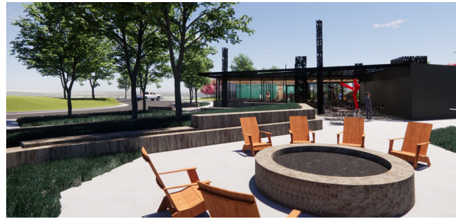
Architectural rendering of the natural gas fire pit at the Cross Timbers Welcome Center

In Edmond, Oklahoma , the ONE Gas Foundation is supporting The Uncommon Ground Sculpture Park, an inclusive, free public destination along historic Route 66. The Foundation grant will include installing a natural gas fire pit at the Cross Timbers Welcome Center. As a highly visible gathering space, the feature will showcase natural gas as a cleaner, efficient and reliable energy source through educational signage.